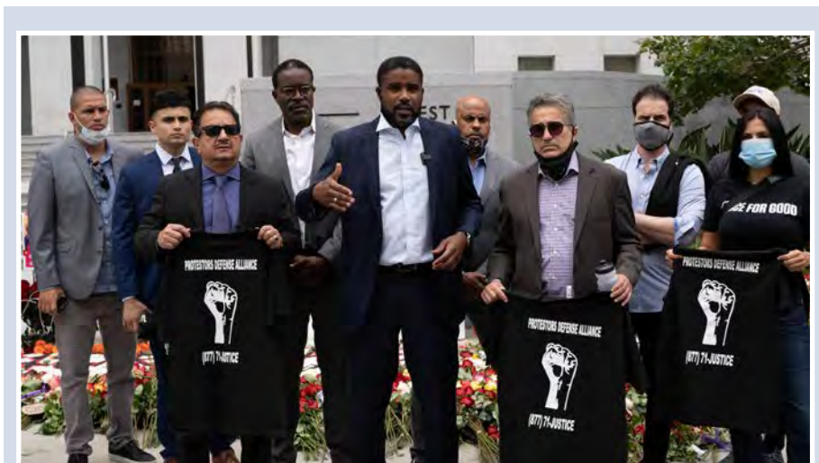
Memorial for individuals killed during law enforcement encounters, May 24, 2020.